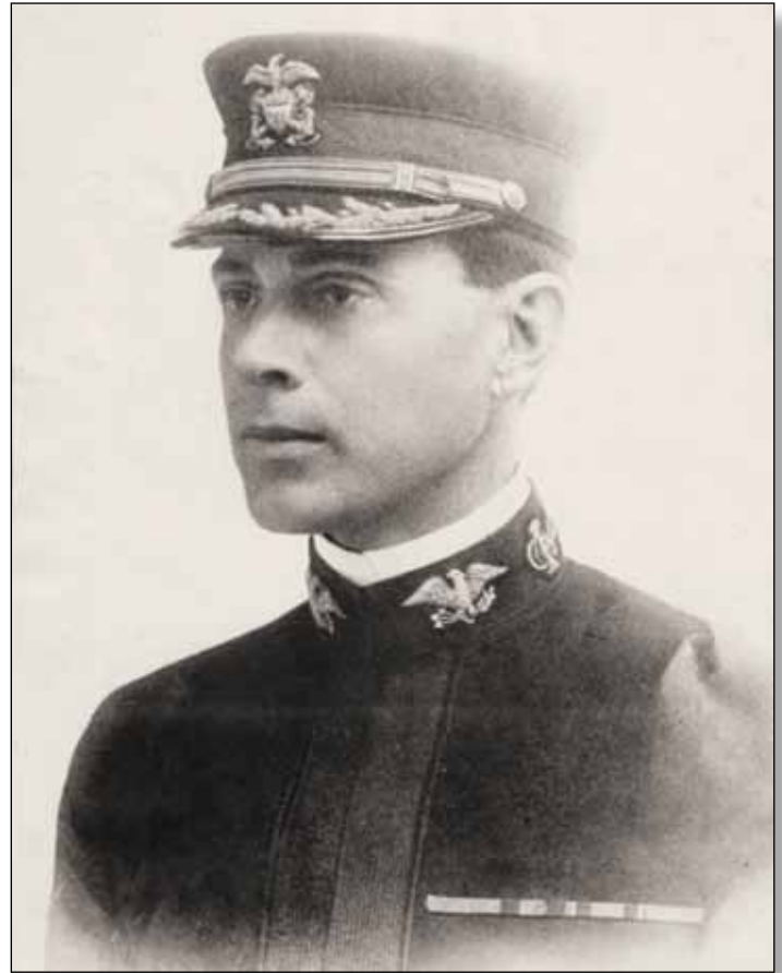
Captain Dudley Knox, circa 1918. In European waters, during the First World War, Knox coordinated U.S. Navy operations with intelligence. He supervised the Planning Section within the “London Flagship” headquarters of Admiral William S. Sims on the European warfront.

For Knox, historical studies provided the ideal foundations for engendering a spirit of professionalism within the U.S. Navy’s ranks. By extension, Knox engaged the American public by orchestrating a propaganda campaign designed to justify the realization of a “Two Ocean Navy” and a “Navy Second to None.” His writings reflected a potent brew of heroic interpretations of America’s maritime past combined with contemporary discussions about the crucial functions of the U.S. Navy as a national institution of the United States. Within the ranks of the service, Knox spearheaded the intellectual charge, framing a strategic argument for the U.S. Navy to pursue operations beyond the American hemisphere.