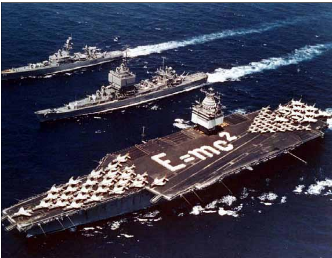
USS Enterprise , USS Long Beach , and USS Bainbridge during Operation Sea Orbit.