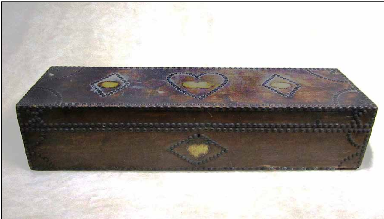
Sailor's Ditty Box

Unfortunately, nothing is known of the sailor who