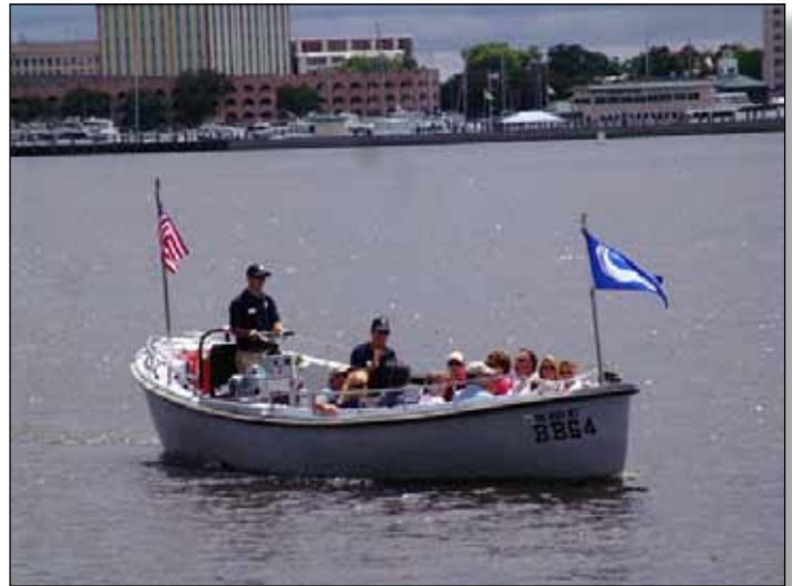
USS Wisconsin 's whaleboat in the Elizabeth River.