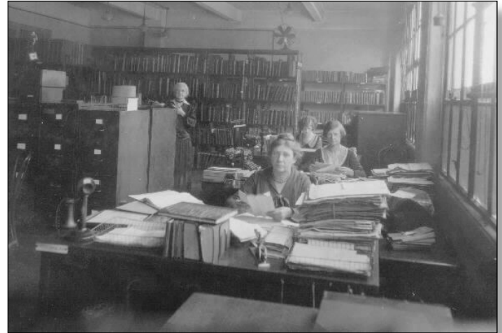
Clerks in the Office of Naval Records. These clerks worked for Dudley Knox during his time with the Office of Naval Records.

Harvard University professors Robert Greenhalgh Albion and Samuel Eliot Morison.