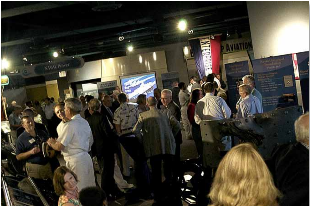
The photo above shows guests at the 50th commemoration of Operation Sea Orbit on May 6, 2014. Attendees included former sailors during Operation Sea Orbit, NHF members and staff, and current Enterprise sailors. In the background is the Enterprise pennant on display for the event.