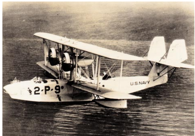
A squadron PM-2 in flight, note the policeman insignia on the bow.

3 Apr 1931: Elements of VP-2D15 completed participation in Fleet Problem XII with Carrier Division One, while VP-8S and VP-10S held off the coast of Guantanamo, Cuba. VP-2D15 aircraft operated from the naval base, while VP-8S was supported by Wright (AV 1) and VP-10S had support from Swann (AM 34) and Whitney (AD 4). The squadron’s 700-mile return flight to Coco Solo, C.Z., took 8 hours and 5 minutes.