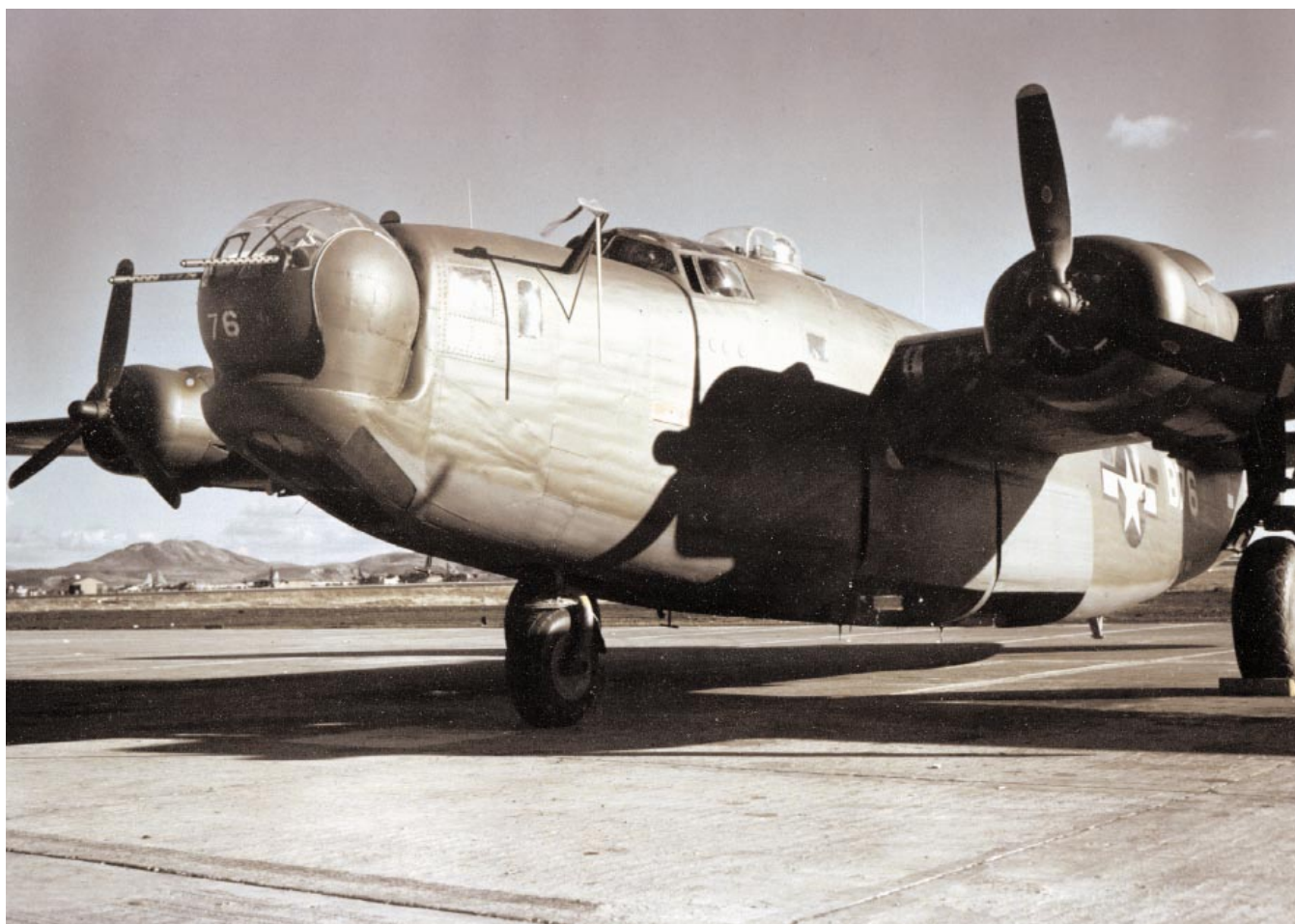
A PB4Y-2 at NAAS Camp Kerney, December 1944, 80-G-K-2678.

1 Apr 1945: VPB-109 was selected to employ the SWOD Mark 9 (Bat) guided bomb. The Bat guided missile was in essence a bomb with wings and control surfaces guided to its target by a mother ship. The Germans had successfully employed similar ordnance in the Mediterranean with great effect. The Bat offered the advantage of being a standoff weapon that allowed the bomber crew to remain out of effective AA range of a surface target while launching the winged bomb at the vessel. The Bat could guide itself to its target by means of target echoes of pulsed microwave radiation emitted by the missile's built-in radar system.