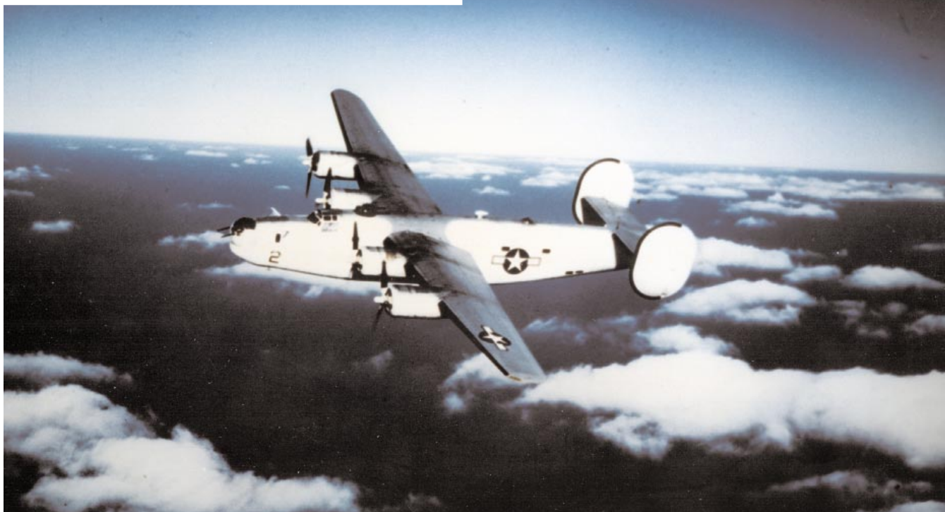
A PB4Y-1 on patrol, 80-G-K-5175.