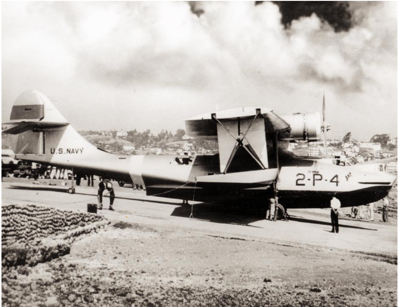
A squadron PBY-2 with the policeman insignia on the bow.