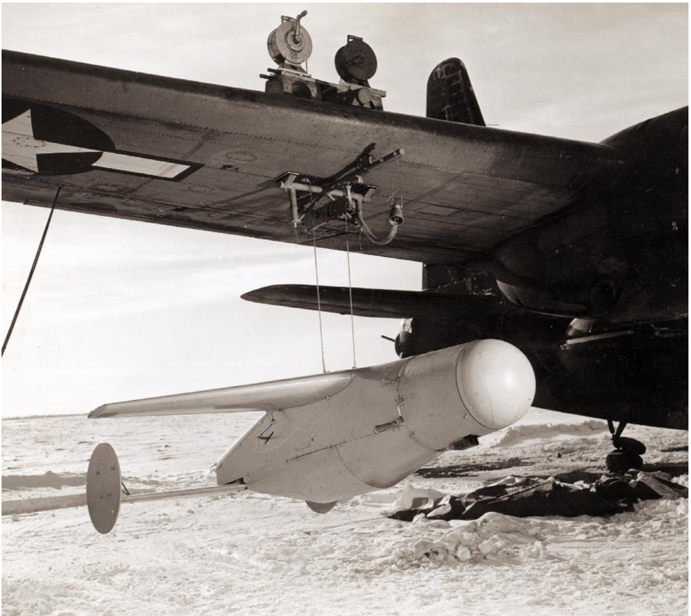
The squadron used Bat missiles in the Pacific during the latter part of the war. This photo shows a Bat missile being placed in position on a PB4Y.