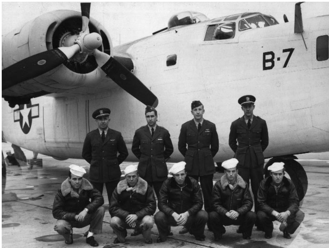
Crew members from VB-112 beside their PB4Y at Quonset Point, 20 October 1943, 80-G-383783.

5 Nov 1943: Orders were received to proceed to NAF Port Lyautey, F.M., via Morrison Field, Fla.; Borinque, P.R.; Waller Field, Trinidad; Belem and Natal, Brazil; and Dakar. The squadron departed Norfolk and arrived by elements at Port Lyautey on 25 November, coming under the operational control of FAW-15. The squadron was based at the former French airfield, Craw Field, with VPB-111, which had arrived two weeks earlier. The two squadrons were replacing an Army unit, the 472 nd Bombardment Group. Patrols commenced immediately. Armor was stripped from the aircraft since the threat from enemy aircraft in the assigned patrol zones was judged minimal. The lessening of weight also made full-combat load takeoffs less dangerous in the dry, thin air of the desert. The primary mission of the squadron was safeguarding the supply routes for the invasion forces going into Italy.