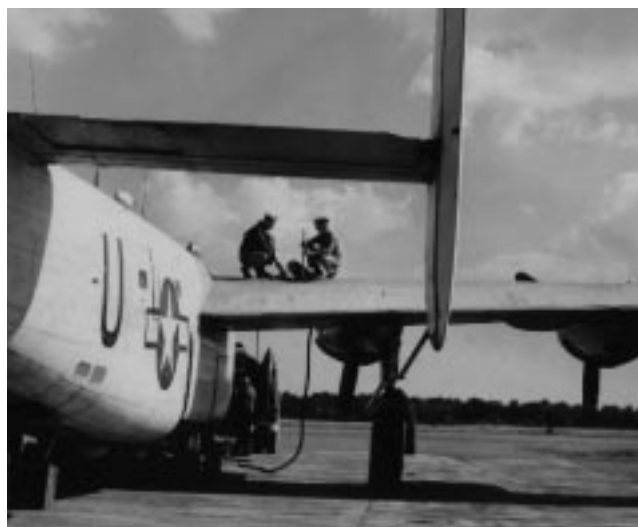
A PB4Y-1 being refueled for a mission, September 1944