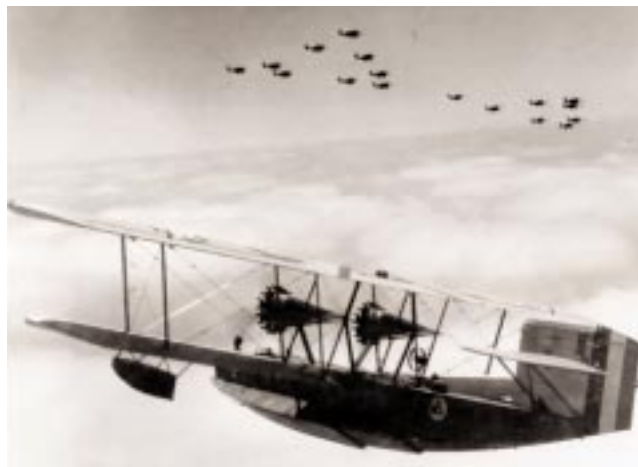
A squadron PD-1 in flight with a formation of fighter aircraft in the upper part of the photo.