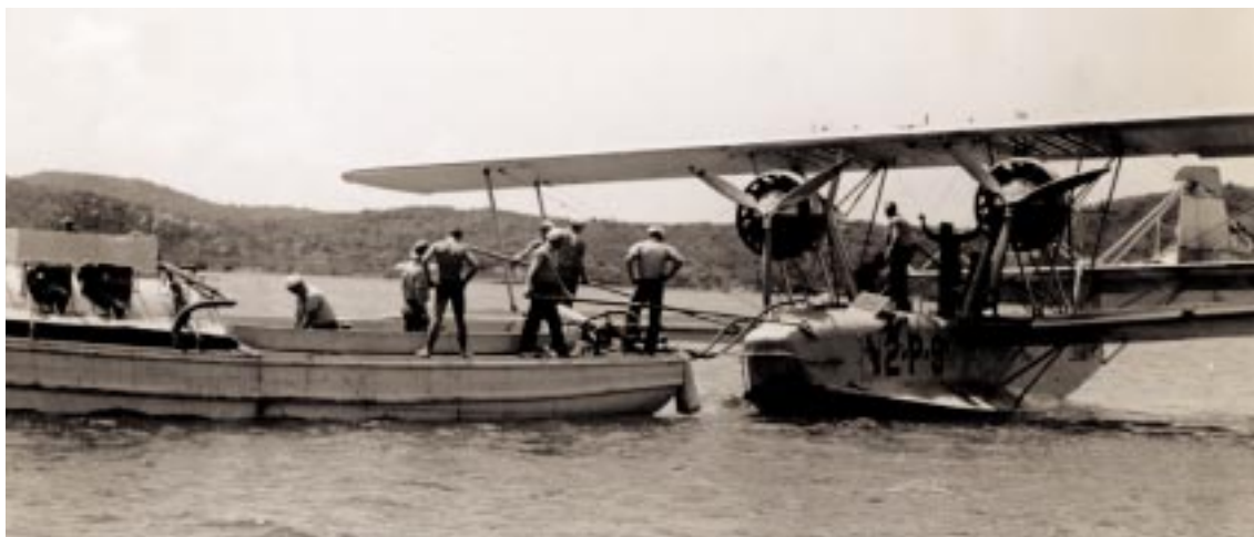
A squadron PM-2 being refueled at Saint Thomas, Virgin Islands, March 1937, note the policeman insignia on the bow.