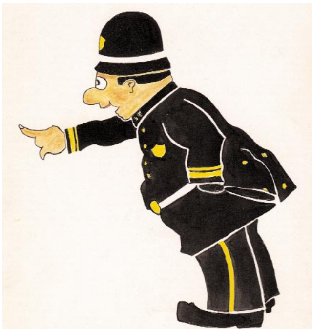
The squadron's well-known insignia.

The first squadron insignia appeared after its redesignation from VP-2D15 to a patrol squadron of the Scouting Fleet in 1931. It is possible the squadron may have used the insignia prior to 1931 and maybe even as far back as 1924. VP-2, in line with its function in the fleet, adopted the insignia of a patrolman chasing an unseen wrongdoer. Colors: hat, black with yellow badge and white band; face, shaded pink; eye, white