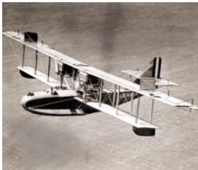
An F-5L in flight.

20 May 1925: VP-10 received new HS-2L flying boats to replace the WWI vintage F-5L and H-16