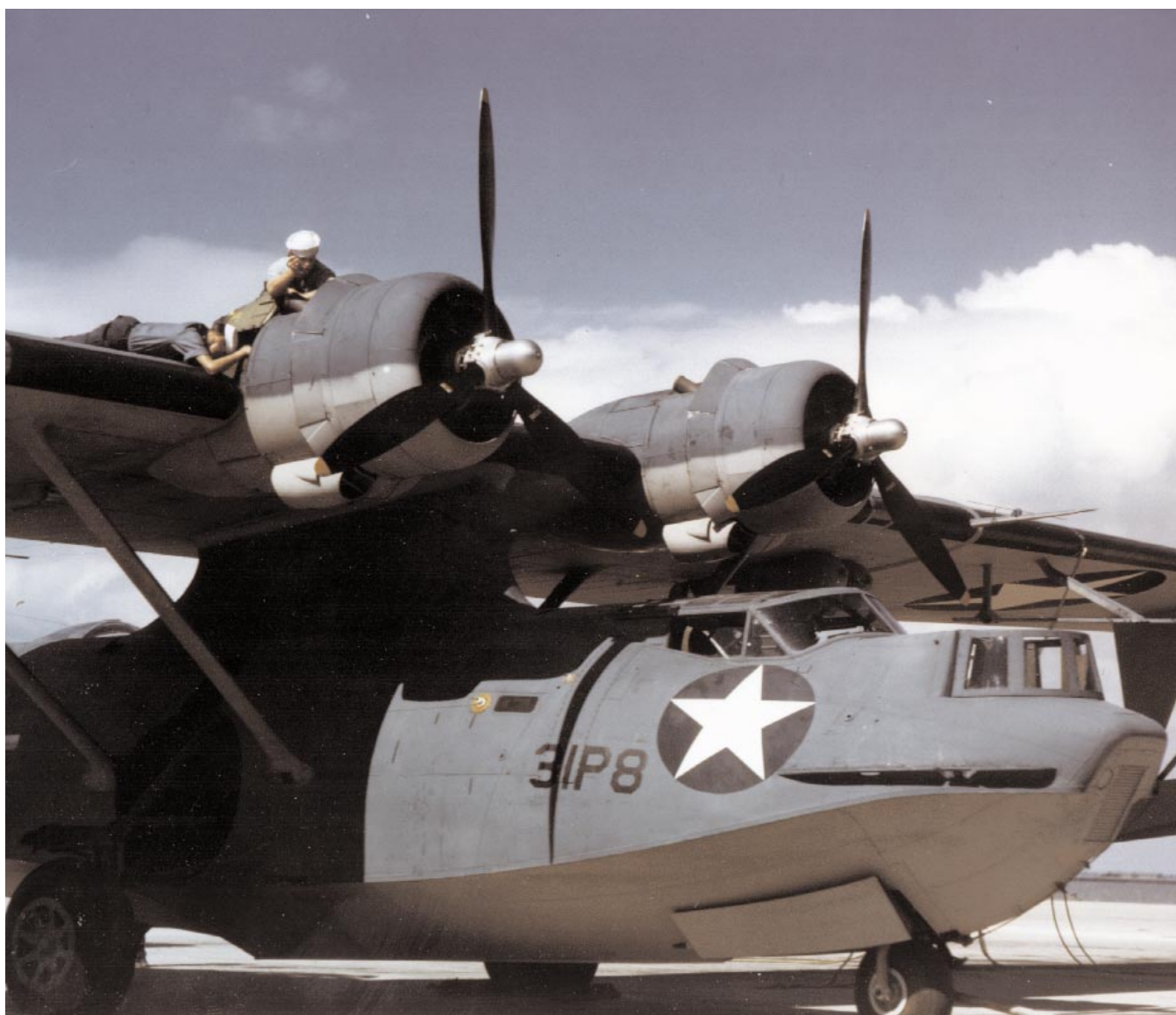
Squadron aviation machinist's mates work on the starboard engine of their PBY-5A, circa 1942, 80-G-K-15310.

1 Oct 1942: A VP-31 detachment was sent to NAS Quonset Point, R.I., to serve with the Narraganset Air Patrol off the northeastern United States. The remain-