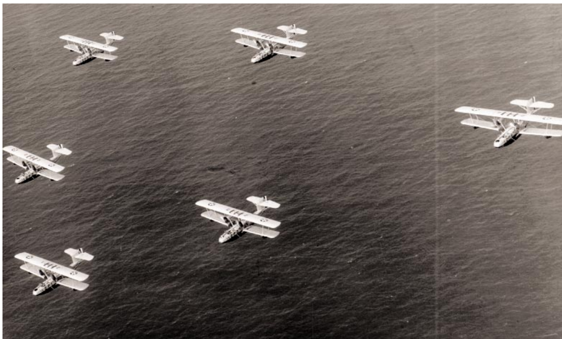
A formation of squadron PD-1s in flight, circa 1930.

1 Apr 1933: VP-2S was redesignated VP-2F, with the F representing the Base Force. A detachment of nine aircraft operated with Wright (AV 1), with remainder of squadron based at NAS San Diego.