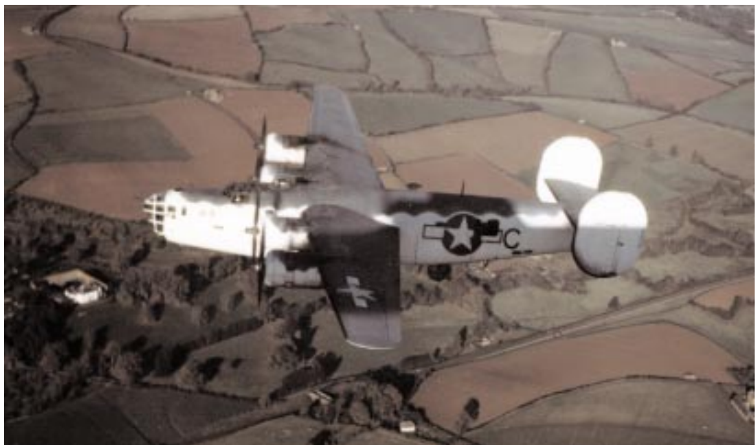
A PB4Y-1 flying over the English countryside en route to a mission over the Bay of Biscay, circa 1943, 80-G-K-14056.

10 Nov 1943: VB-105 was a participant in one of the longest surface battles of aircraft against a U-boat in WWII. At 0800, a VB-105 aircraft piloted by Lieutenant L. E. Harmon, was alerted by an RAF aircraft of a radar contact near the coast of Spain. Harmon located the surfaced U-966 , Oberleutenant Eckehard Wolf commanding and made two strafing attacks. Heavy AA fire damaged his aircraft and forced him to break off the attack. An RAF fighter then dove to attack the submarine. Harmon made a third strafing attack but had to break off afterwards due to a fuel shortage. Lieutenant K. L. Wright, of VB-103, located U-966 near Ferrol at 1040 and delivered a strafing and depth charge attack. Intense AA fire drove him off and he had to depart the target due to lack of fuel. Lieutenant W. W. Parish and crew then arrived on the scene. A depth charge attack was conducted in cooperation with a rocket-firing RAF Liberator at 1230. The submarine was abandoned by its crew after running aground at Oritiguera, Spain, with eight of its crew of 49 killed in action. The German crewmen were quickly picked up by nearby Spanish fishing vessels and interned by the Spanish government.