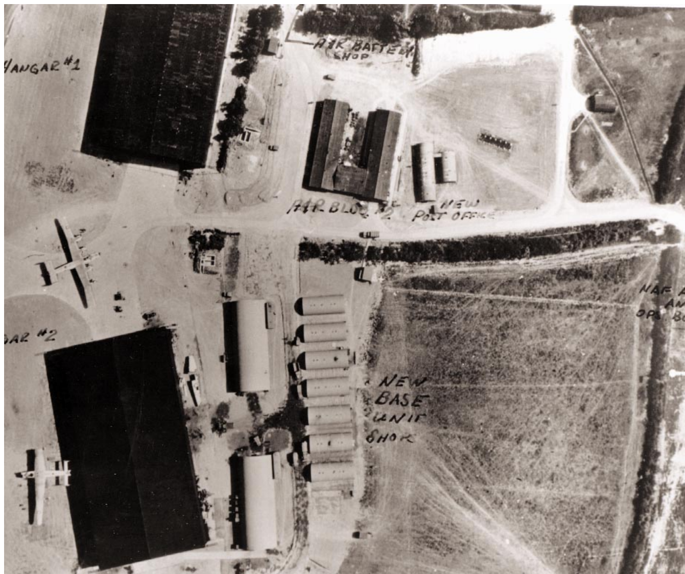
An overhead view of NAF Dunkeswell, England, showing the hangars and several PB4Y-1s, June 1944, NH-96258.