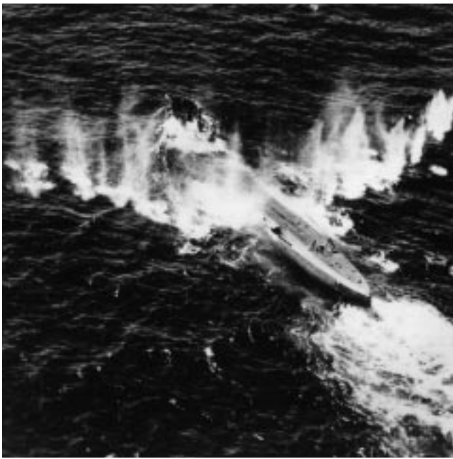
A squadron attack against a U-boat on 3 July 1943. The attack did not result in the sinking of the submarine, 80-G-451454a.

Field, Bermuda, for operational long-range training flights.