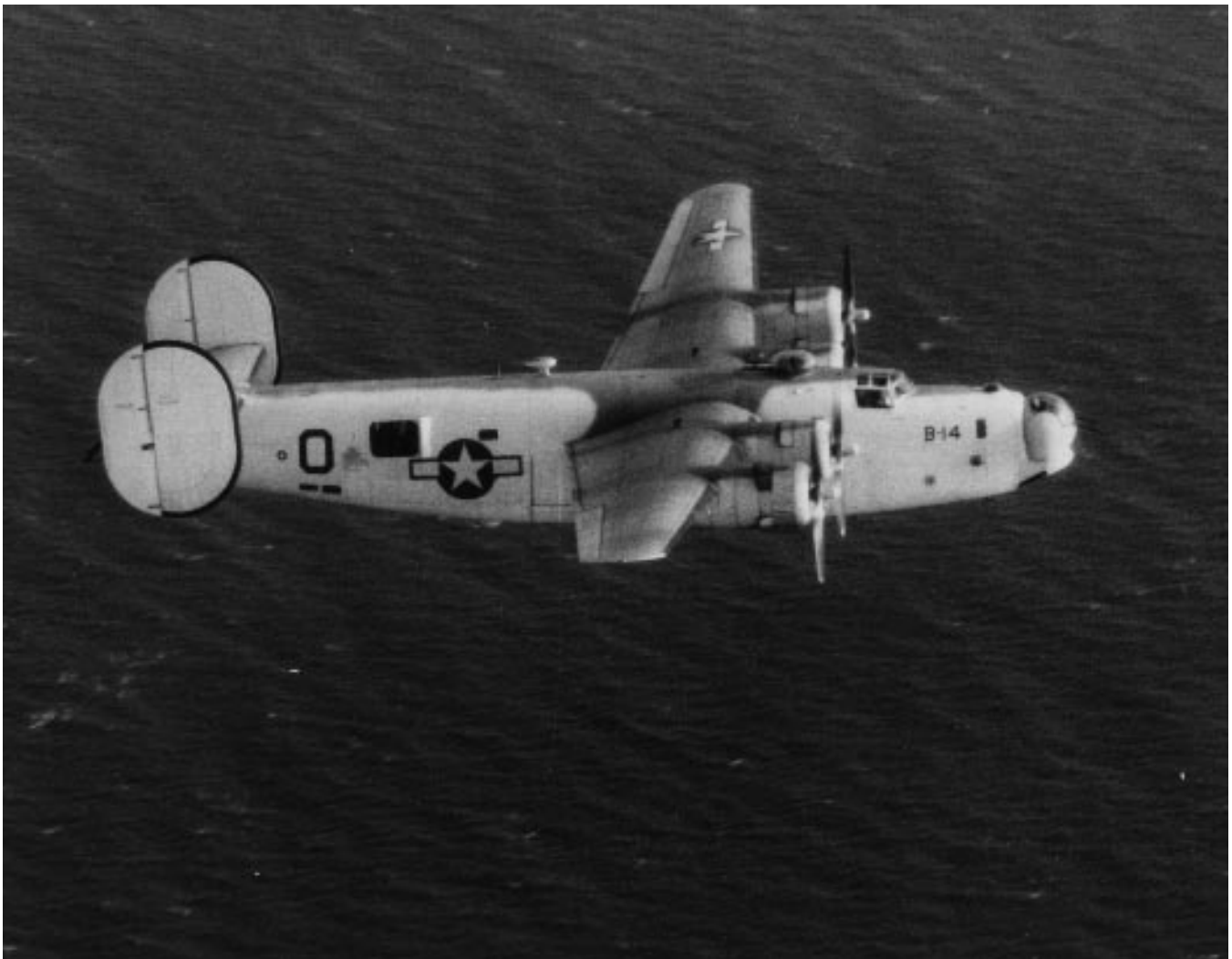
A squadron PB4Y-1 on patrol, September 1944, 80-G-282243 (Courtesy Captain Jerry Mason, USN).

1 Sep 1945: The squadron had been scheduled for reforming at NAS Seattle, Wash., as a PB4Y-2 Privateer squadron on 15 September. The cessation of hostilities and subsequent surrender of Japan ended the necessity for the continued existence of large numbers of Navy patrol squadrons. VPB-110 personnel were given new orders for either demobilization or extension of duty, and on 1 September 1945 the squadron was disestablished at NAS Seattle, Wash.