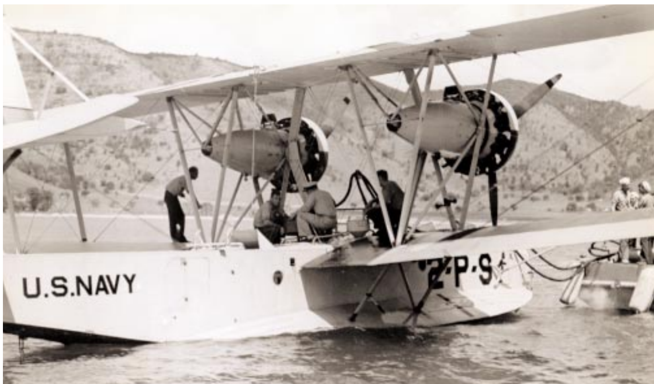
A squadron PM-2 being refueled at Saint Thomas, Virgin Islands, 1937.