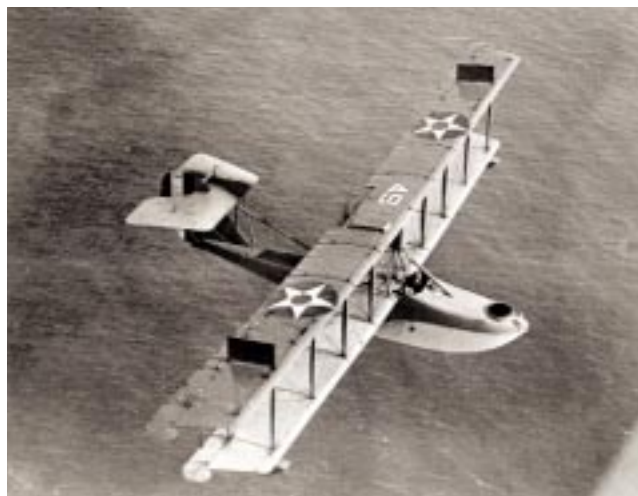
An HS-2 in flight.