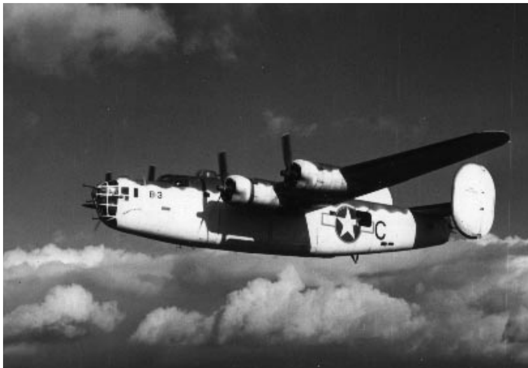
A PB4Y-1 flying over England en route to a patrol over the Bay of Biscay, November 1943, 80-G-407694.