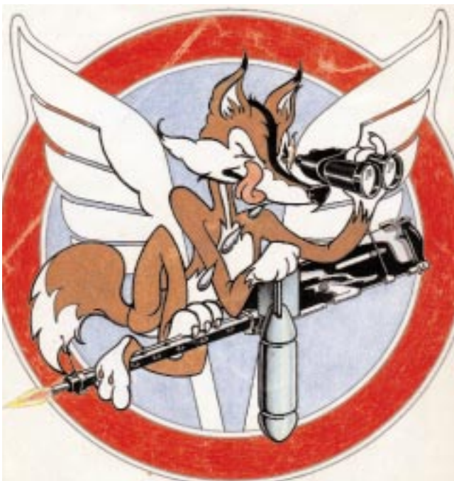
The squadron's cartoon design insignia.

The insignia for VPB-110 was approved by CNO on 3 February 1945. A fox holding a pair of binoculars in his left paw and a bomb in his right straddled a 50-cal-