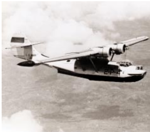
A squadron PBY-2 in flight.

9 Mar–1 Apr 1940: VP-31 was assigned to Neutrality Patrols, operating in conjunction with VP-53 out of NAS Key West, Fla. After the invasion of Poland on 3 September 1939, President Roosevelt declared the neutrality of the United States and directed the Navy to begin a Neutrality Patrol in the Atlantic. It extended