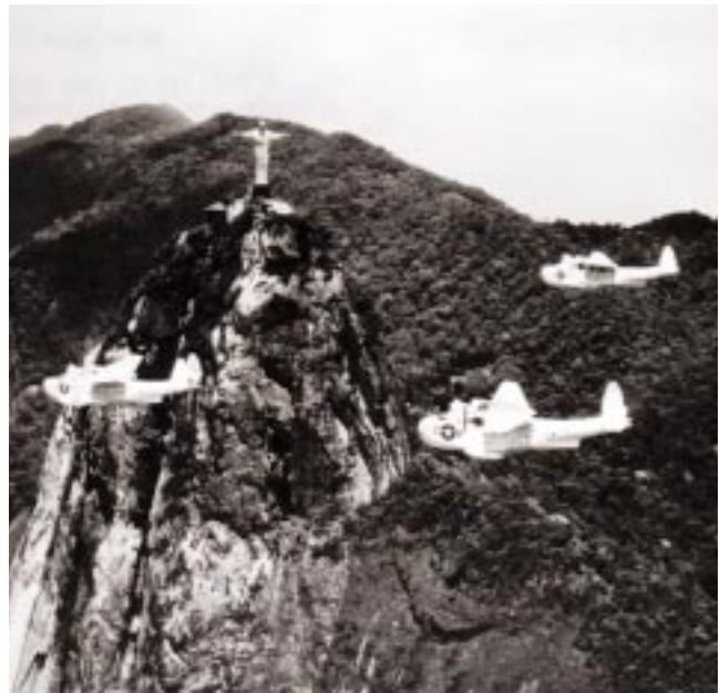
Squadron PMB-3s in formation flight in Brazil, December 1943.