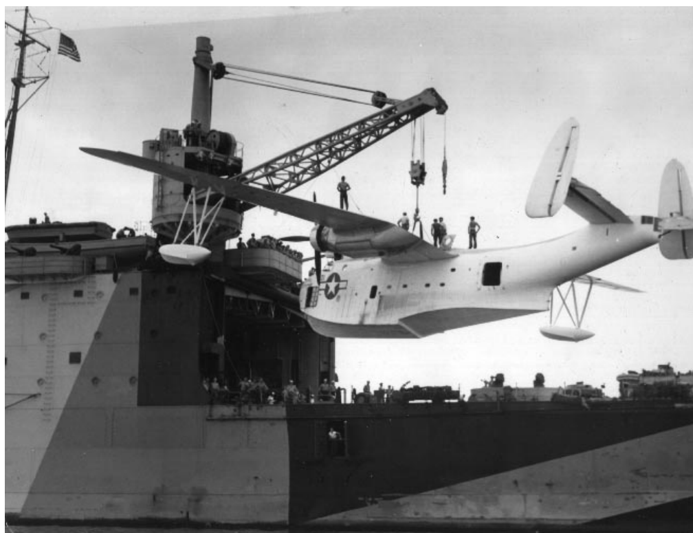
A squadron PBM-3 being hoisted aboard Albemarle (AV 5) at Guantanamo Bay, 5 January 1945, 80-G-304428.