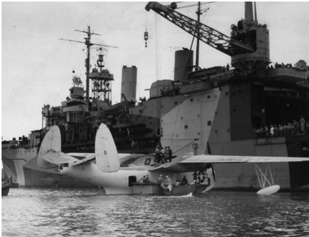
A squadron PBM-3 being prepared for hoisting aboard Albemarle (AV 5) at Guantanamo Bay, 5 January 1945, 80-G-304427.