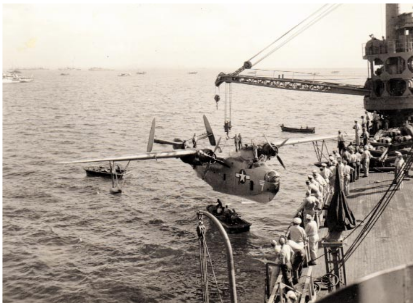
A squadron PBM-3D being hoisted aboard Chandeleur (AV 10) for repairs, 24 June 1944.