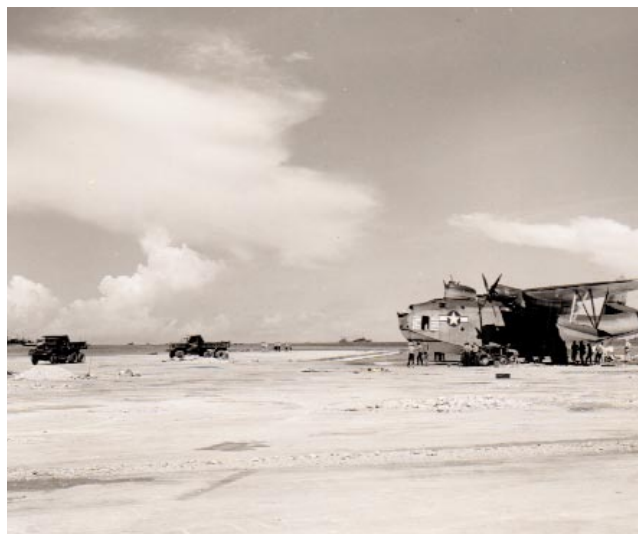
A squadron PBM-3D beached on Saipan, 10 July 1944.