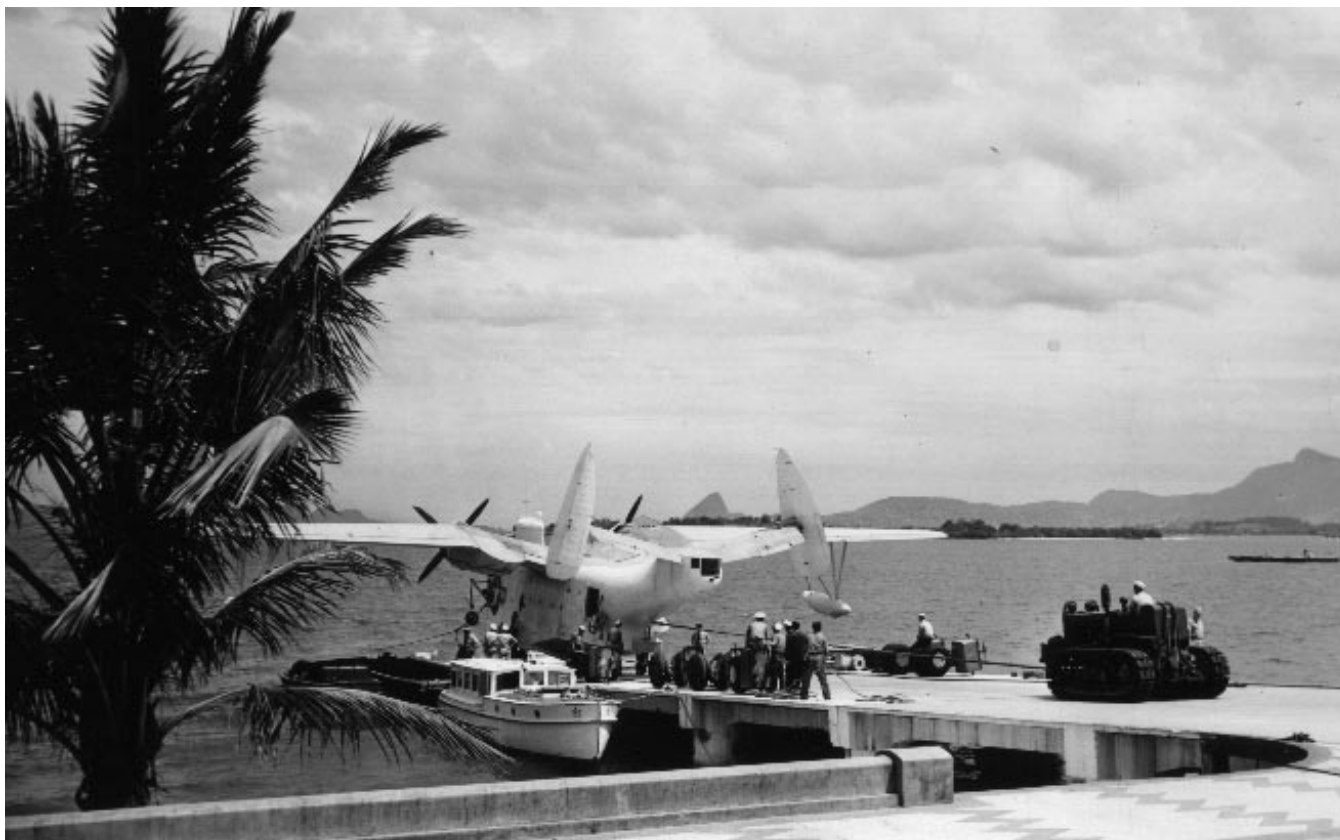
A squadron PBM-3 being beached at Galeao, Brazil, 17 December 1943, 80-G-56943 (Courtesy Captain Jerry Mason, USN).

27 Sep 1943: VP-211 received orders to deploy to NAF Aratu, Bahia, Brazil. The squadron's last section of four aircraft arrived at Aratu on 16 October and relieved VP-74, coming under the operational control of FAW-16. VP-211 became a part of Task Force 44, an integral part of the Fourth Fleet. A detachment of six aircraft was maintained at Governor's Island, NAF Galeao, Rio de Janeiro, Brazil, due to the distance of Aratu from the "slot" where U-boat hunting was so abundant. The slot was the area where the U-boats traversed the Atlantic from north to south via a regular route. On 12 November the squadron shifted its headquarters to Galeao for a three-month period, leaving a three-aircraft detachment at Aratu. NAF Galeao, while nearer to the hunting area, had primitive living condi-