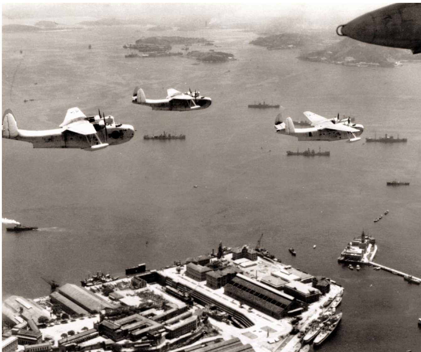
Squadron PBM-3s in formation over the Brazilian naval dockyard at Rio de Janeiro, December 1943, NH-94610.

* Continued combat deployment in South Atlantic, moving from base to base.