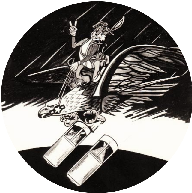
The squadron's cartoon insignia.

The squadron's insignia was approved by CNO on 17 December 1943, while still designated VP-209. The central figure in the design was the comic character