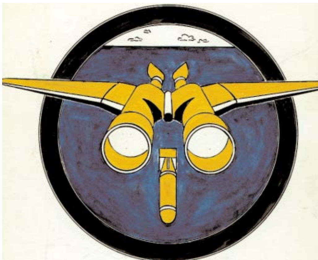
The squadron's insignia.

The VP-215 insignia was approved by CNO on 15 July 1944. The design consisted of a pair of Navy