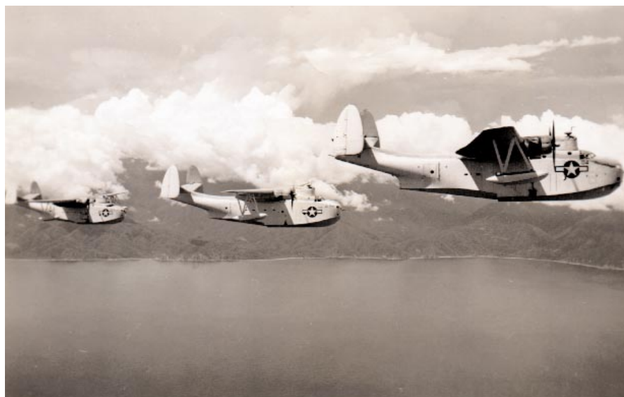
Squadron PBM-3s in formation off the coast of Cuba.