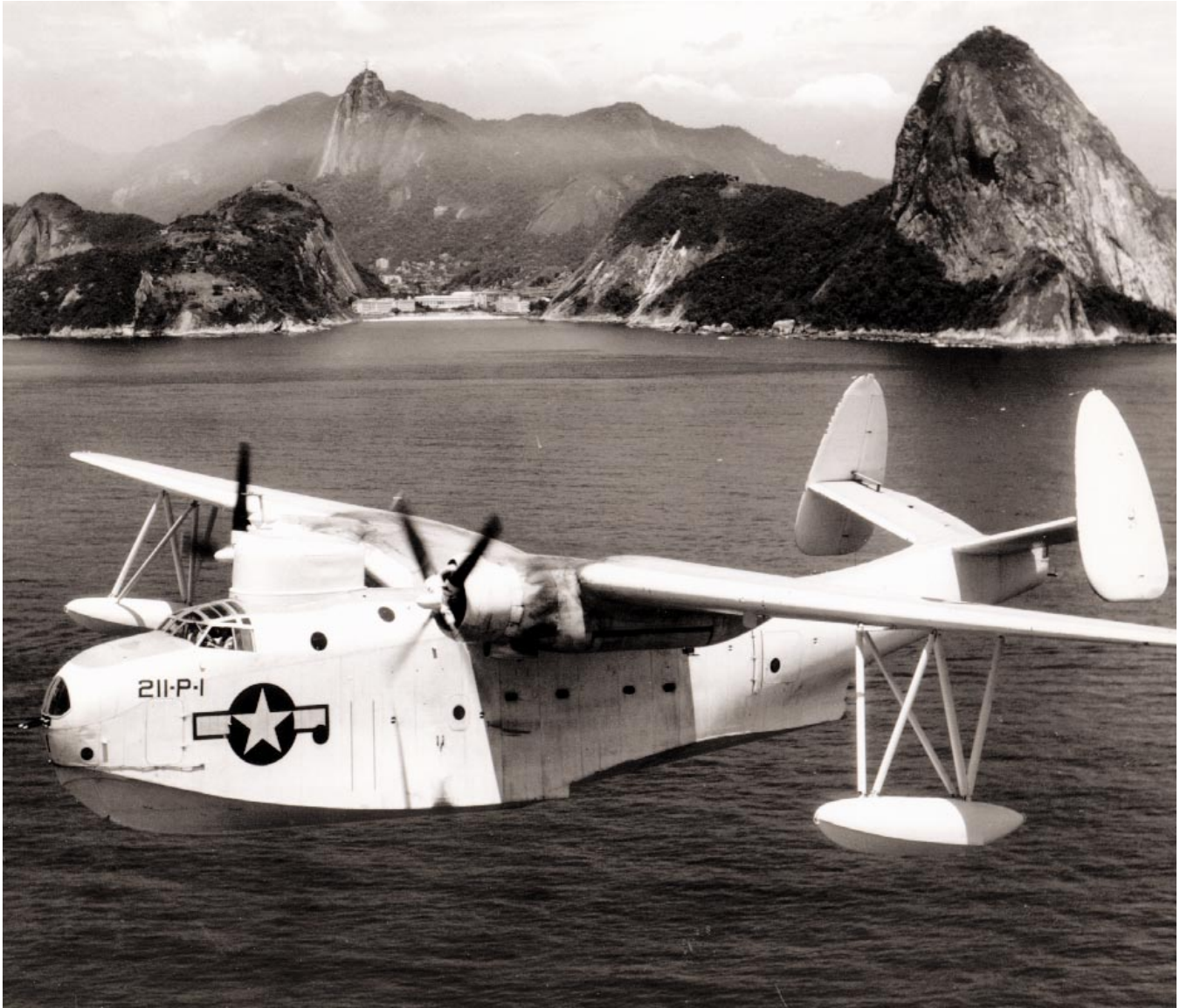
A squadron PBM-3 in flight in Brazil.