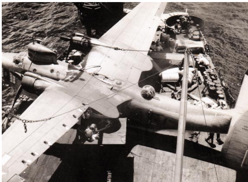
A squadron PBM-3D aboard Chandeleur (AV 10) for repairs, 24 June 1944.