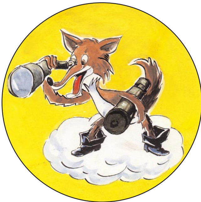
The squadron's cartoon insignia.

The squadron's only official insignia was approved by CNO on 25 February 1946, while it was designated VPB-212. The original submission, forwarded to BuAer